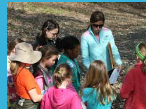
Sasqua member leading Fairfield Brownie Troop to remove invasive garlic mustard in Woodland Edge Habitat Garden