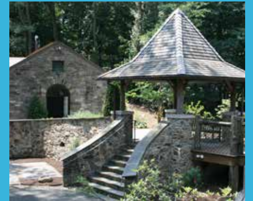
Birdcraft Museum 2014, National Historic Landmark