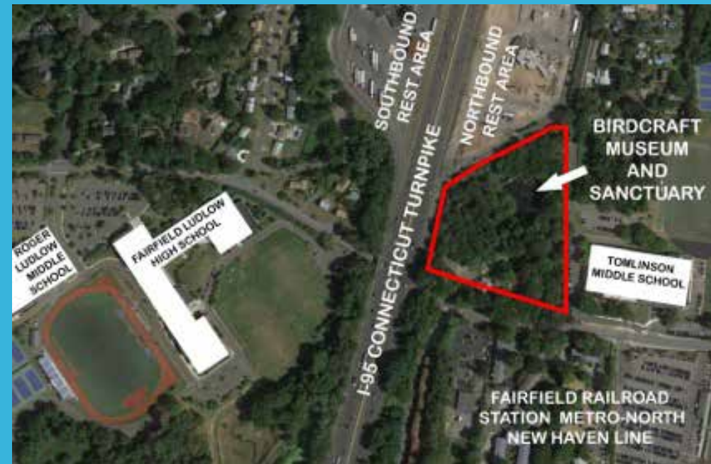
Birdcraft Museum and Sanctuary located in downtown Fairfield, CT