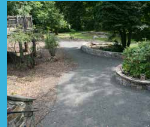
2014 After Sasqua cleared and started planting. This space is now part of the Urban Terrace Habitat Garden