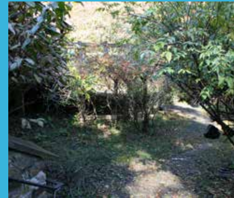
2011 Before Sasqua cleared and removed invasive plants

The Living Classroom will allow thousands of Fairfield and inner-city students to emerge from the Museum and enter a natural habitat where they can see, touch, and understand how native plants play a critical role in healthy ecosystems.